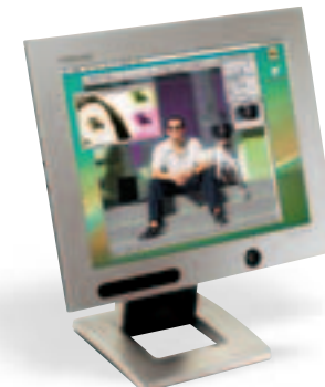
The F. A. Porsche designed 151P offers digital/analog inputs, a 450:1 contrast ratio and 1024 x 768 maximum resolution.