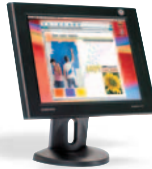
The sleek designed 171S gives you more space, more screen, and more performance for the price.