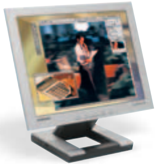
The latest in LCD technology, the 172B multi-media display produces crisp text and images with superior brightness.