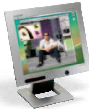
The F. A. Porsche designed 171P's Digital Video Interface guarantees sharper images and more accurate video reproduction.