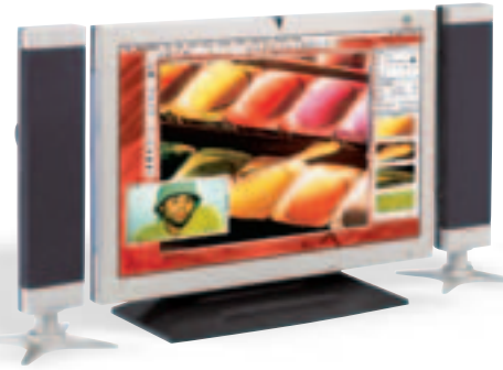
From CAD/CAM drawings to creating extensively layered graphics this monitor delivers larger than life performance.