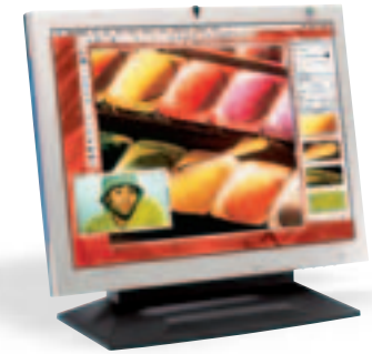
The versatile 210T offers an array of features including PIP, auto adjustment and precision color control.