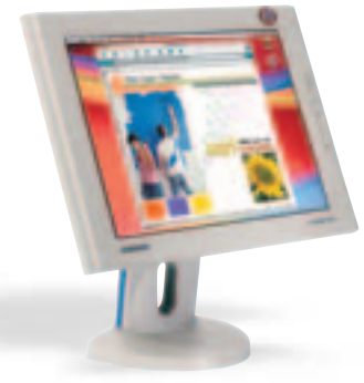
The thin bezel design of the 151S has recently been selected as an Editors' Choice from CNET.

a-si TFT/PVA 17" 0.264 250cd/m 2 500:1 170°/170° Analog